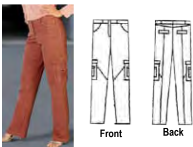
#3500 – Carolyn's Cargo Pant