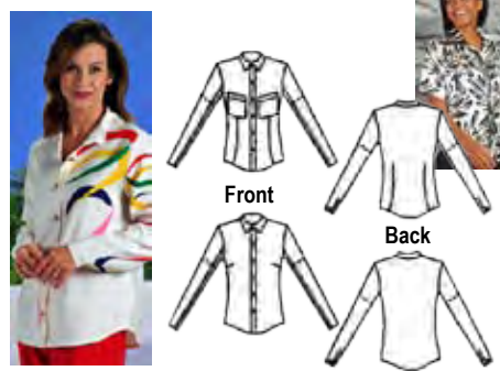
#600 – Classic Blouse