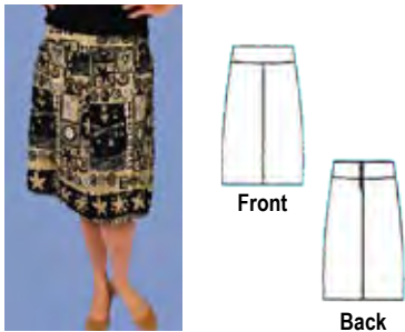
#2750 – Amy's Skirt