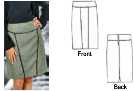
#2650 – Donna's Skirt