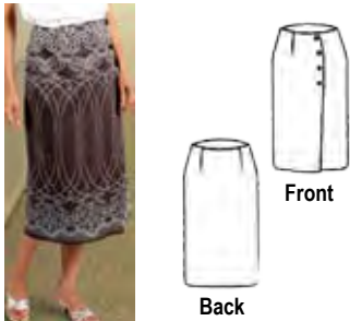
#2050 – Wrap Around Skirt