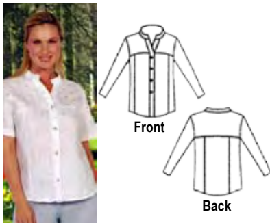
#575 – Sonya’s Blouse