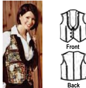
#800 – Vest