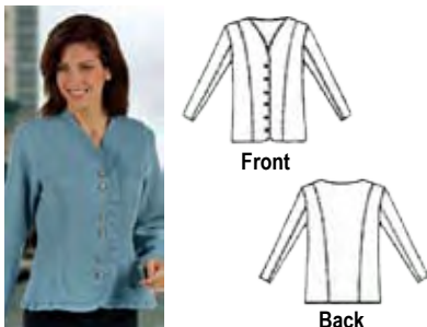
#700 – Alex’s Blouse