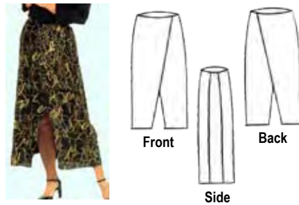
#2250 – Asymmetrical Skirt