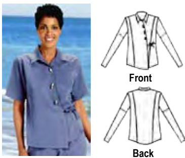
#650 – No-Gap Wrap