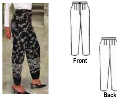
#3200 – Sally's Pant