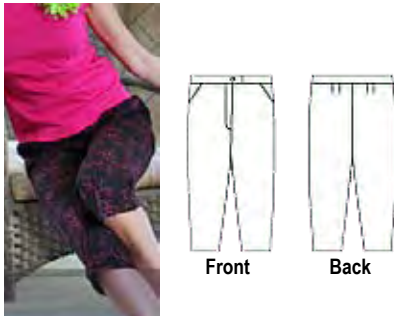
#3009 – Capri Pant